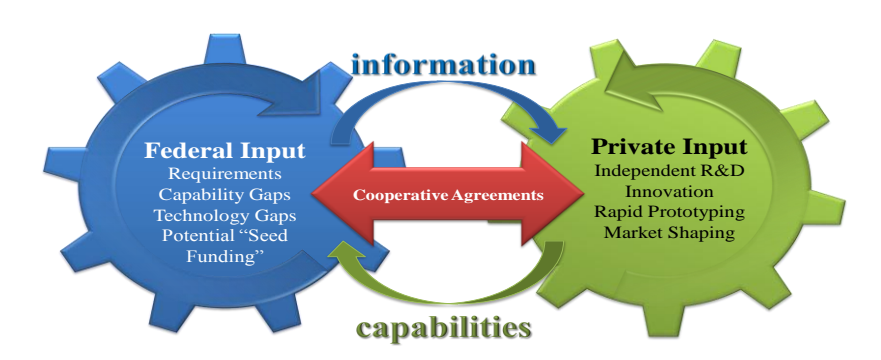
Figure 3 CoI leverages cooperative agreements that facilitate open communication and cooperative research and development.

As illustrated in Figure 2, the CoI is successfully exploring ways to build cooperative relationships with industry to further these goals. Using cooperative agreements for research, many of which are already underway with companies like Intel Corporation and the IBM Watson Research Center, the CoI is able to jointly conduct research with private sector companies (driven by Moore's Law) in an established framework for federally-assisted research. The CoI holds that these types of research vehicles address some of the challenges highlighted in the GAO report that constrain private stakeholders from engaging in cooperative research with the Federal government because of the legitimate fear of losing sustainable competitive business advantage.